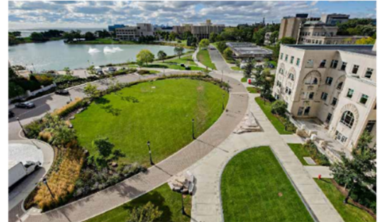
Landscape enhancements adjacent to natural features reinforce the physical quality of a campus setting.

This may also include working with other stakeholders to support off-site and broader community linkages such as trail investments, lighting, and wayfinding.