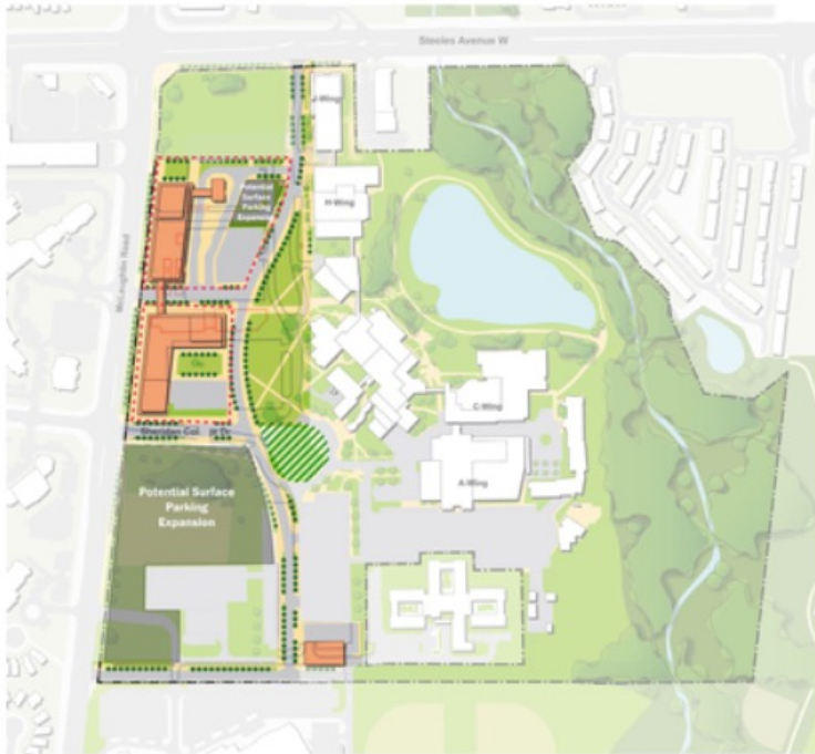
Short Term Plan (0-15 yrs)