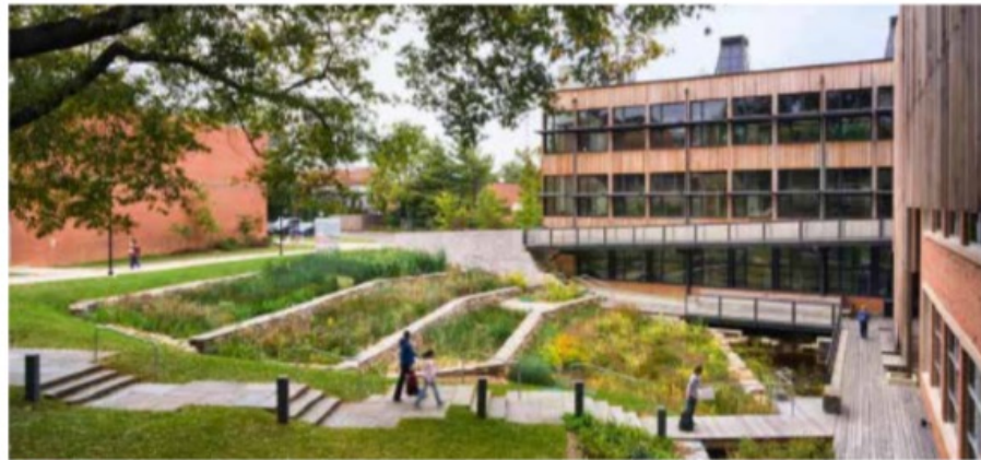
7. Continue to lead with best practices in sustainability (Sidwell Friends Middle School - Washington DC)