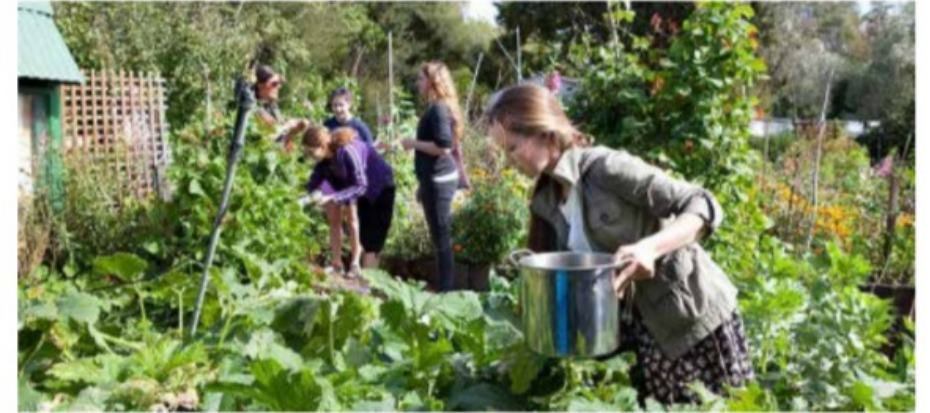
6. Seek opportunities to reinforce Sheridan's relevance to the community through engagement and partnerships (Waiutuutu Community Garden - University of Canterbury, Christchurch NZ)