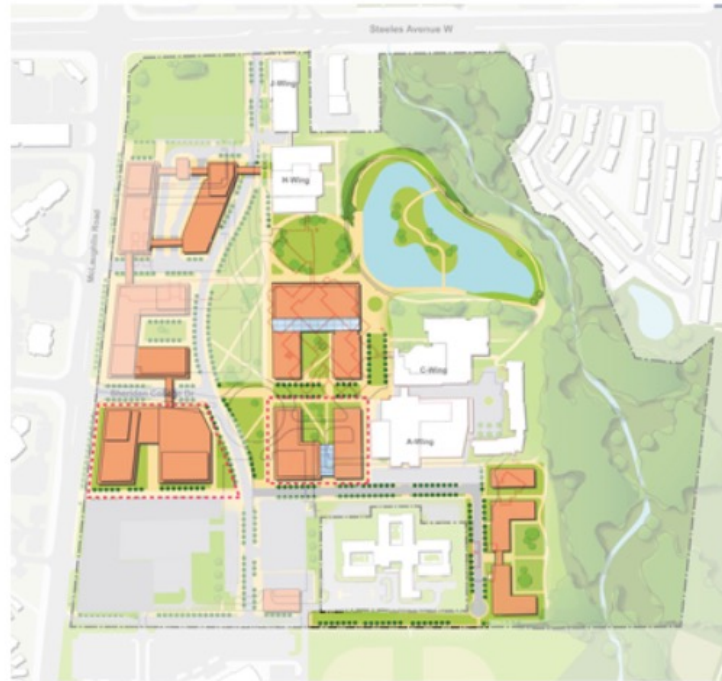
Medium Term Plan (15-25 yrs)