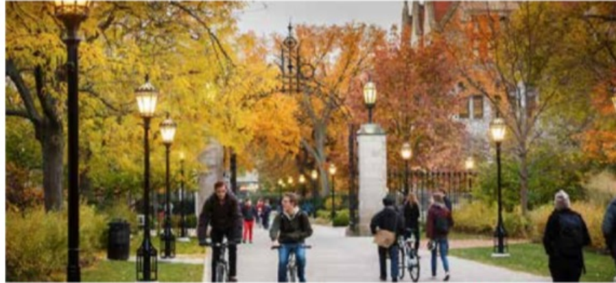
5. Enhance existing open spaces to encourage health and wellness (University of Chicago)