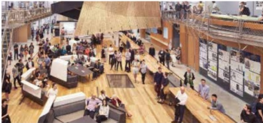
3. Build flexible student life hubs that foster collaboration and inclusion (Melbourne School of Design - Melbourne, Australia)