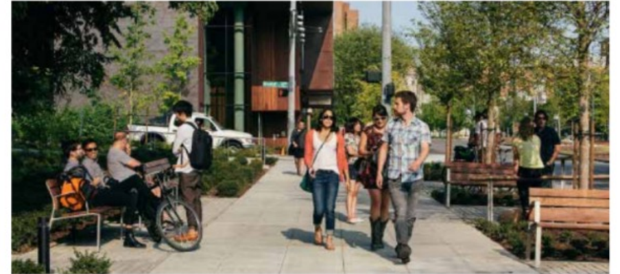
2. Create a clear and efficient network of streets and blocks that can be logically phased (University of Washington - Seattle WA)