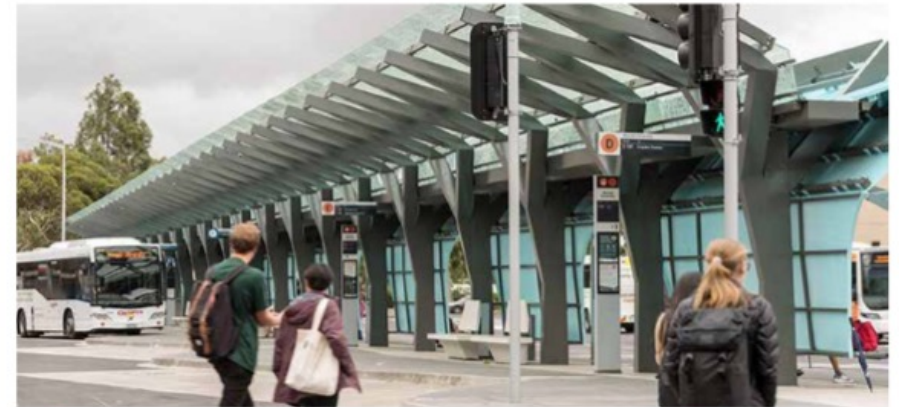
4. Optimize transit infrastructure to create a safe, efficient service (Monash University Transit Hub - Melbourne, Australia)