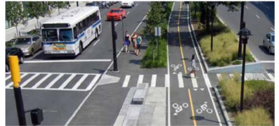
8. Prioritize active transportation on campus (Queens Plaza - New York NY)