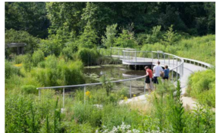
Opportunities to engage with water features support well-being by providing a relaxed, tranquil campus setting.