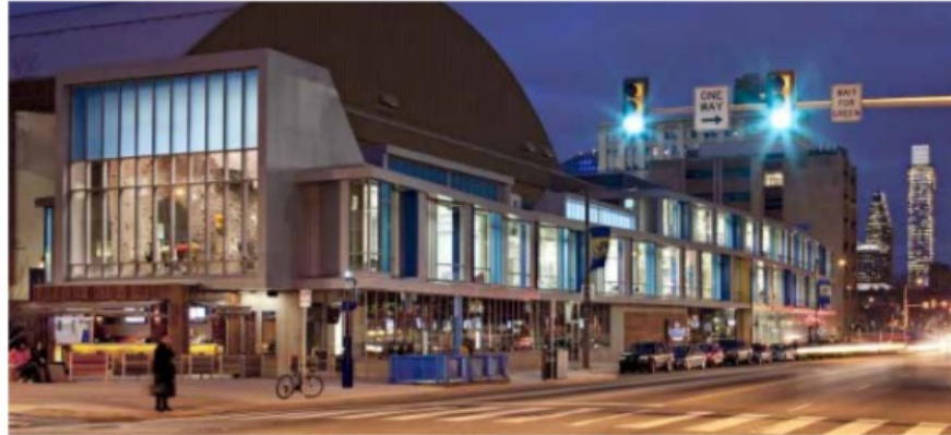
1. Develop a strong presence on McLaughlin Road to reinforce a sense of arrival and showcase Sheridan's brand identity (Drexel University - Philadelphia PA)

The campus principles were developed to respond to the issues and opportunities of the campus today. The principles guide the vision for change at Davis Campus and inform the content of the Master Plan.